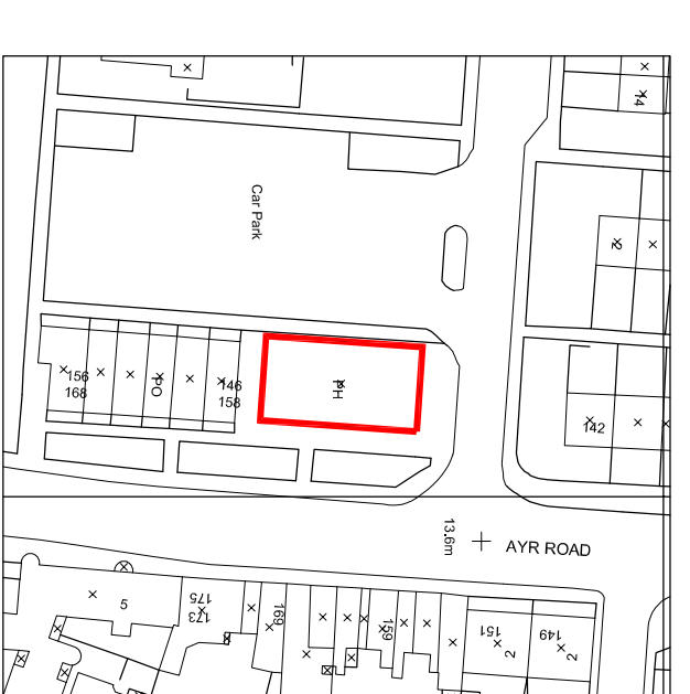
Location Plan scale 1 / 1250 @A1

All levels and dimensions to be checked on site prior to construction / fabrication; report discrepancies immediately. Do not scale dimensions from this drawings. This drawing is copyright protected.