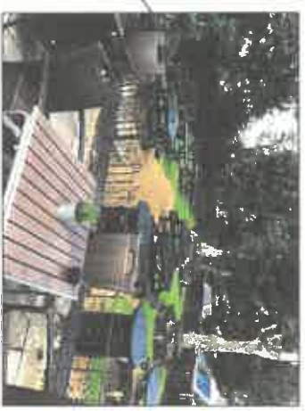
Typical Furniture example (NTS)