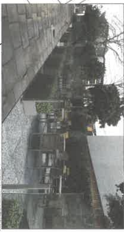
3D Visual (NTS) P01