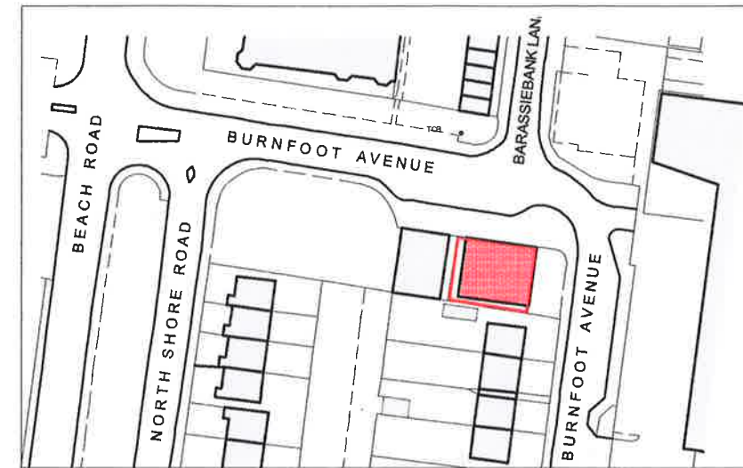
Location Plan (Scale: 1/1250)