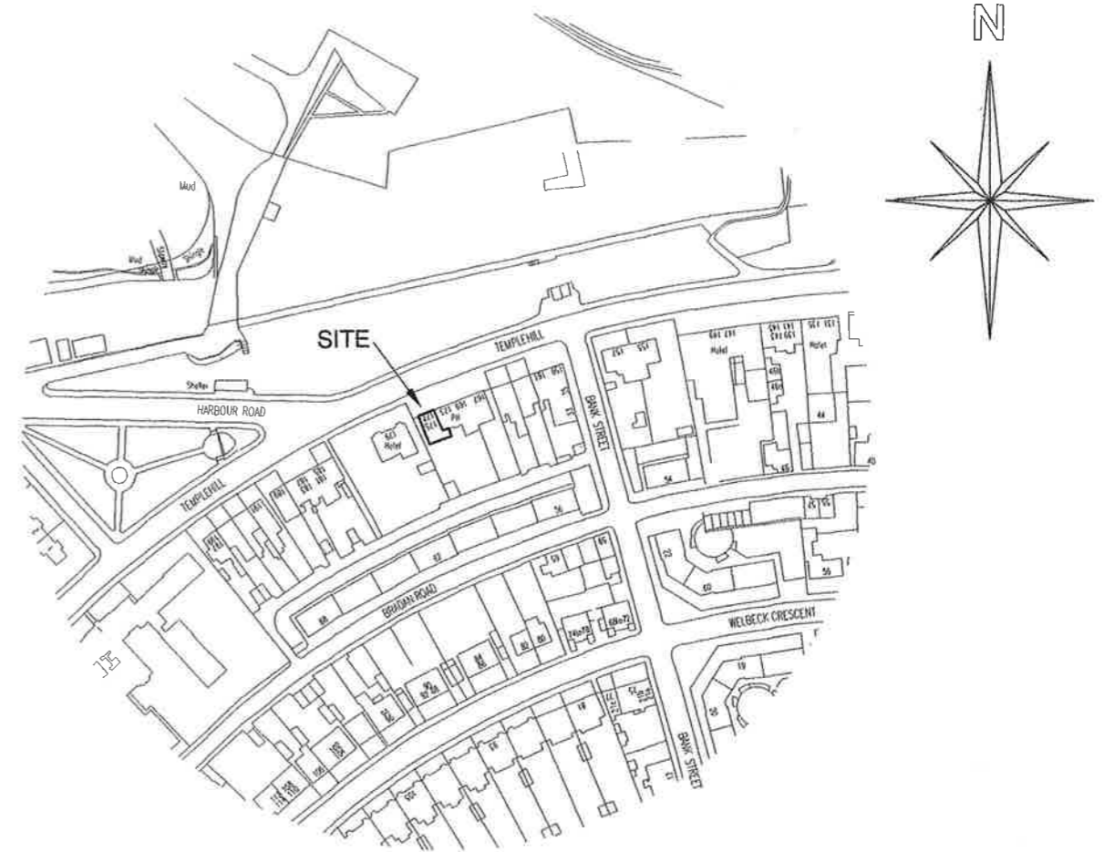
Location Plan 1:2500