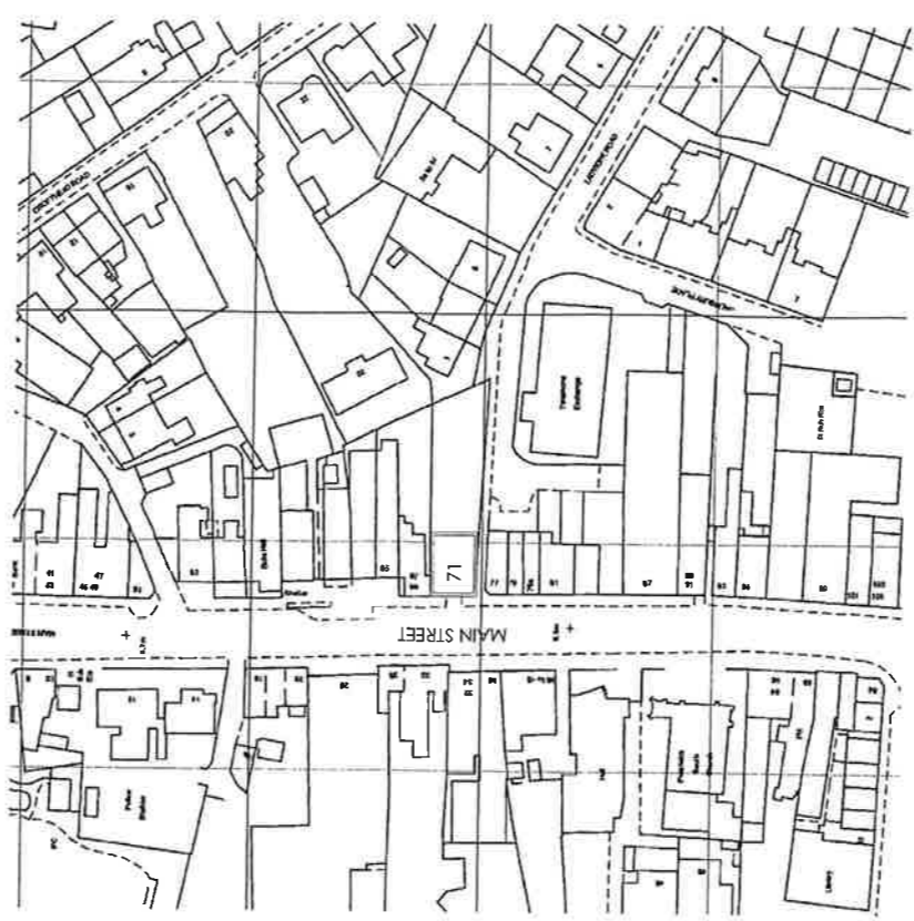
location plan 1:1250