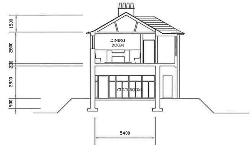
Typical Section Through Club Room 1:100 A-A