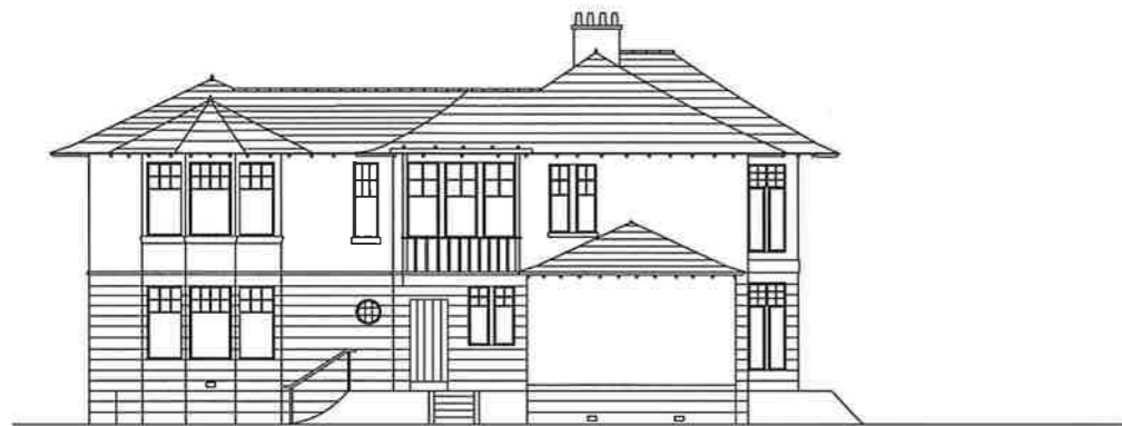
North Elevation 1:100