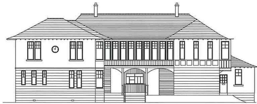
East Elevation 1:100