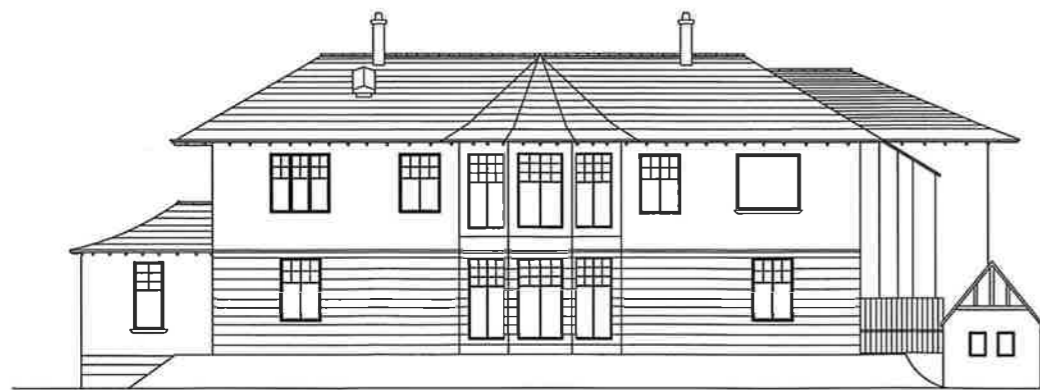
North Elevation 1:100